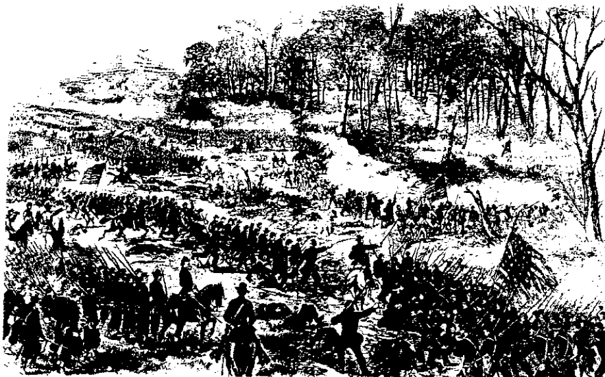
The Missouri Brigade is depicted in position along the woodline during the final stages of the Battle of Champion Hill

While I've corresponded with some historians who are authorities on Confederate uniforms, consulted a number of memoirs, and asked for other documentation over the internet; my research is far from exhaustive. Hence, the aforementioned challenge: Can you find any photographic or written evidence of NCO chevrons being commonly worn by Army of Tennessee troops in the field? If they didn't wear them, should we?